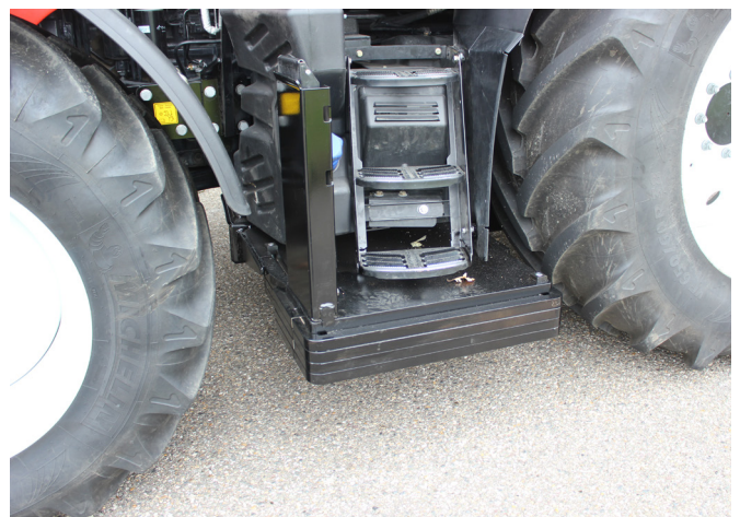
Counter weight for extra stability.