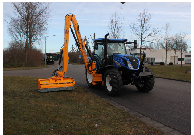
Cavalier with ecomower (KMU).