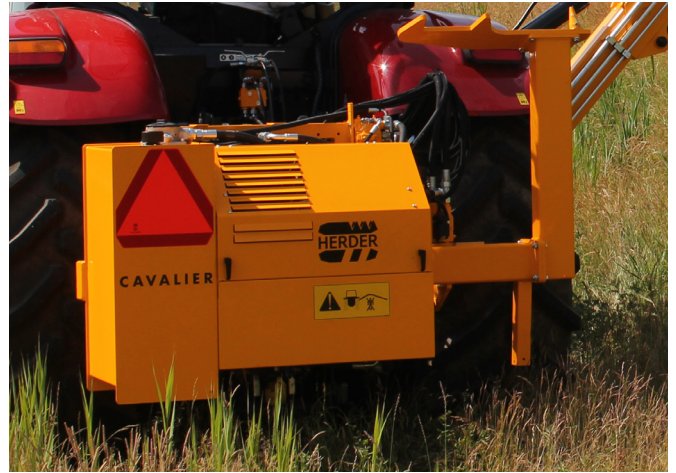
Simple but functional hydraulic unit carried in the 3-point linkage of the tractor, combined with a transport support on the back.