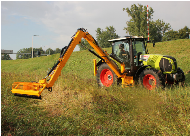
Cavalier with mowing bucket.