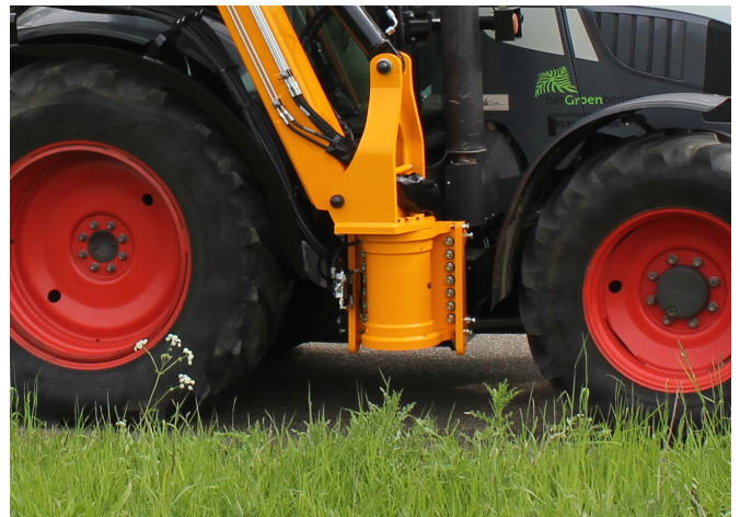
Slewing unit Cavalier MBK420D