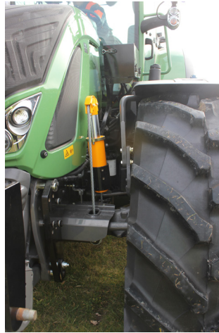
Front axle stabilisation is no luxury, but a real necessity. On the left a fixed front axle and on the right a suspended front axle.