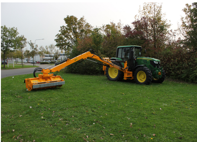
Cavalier with ecomower (KMU).