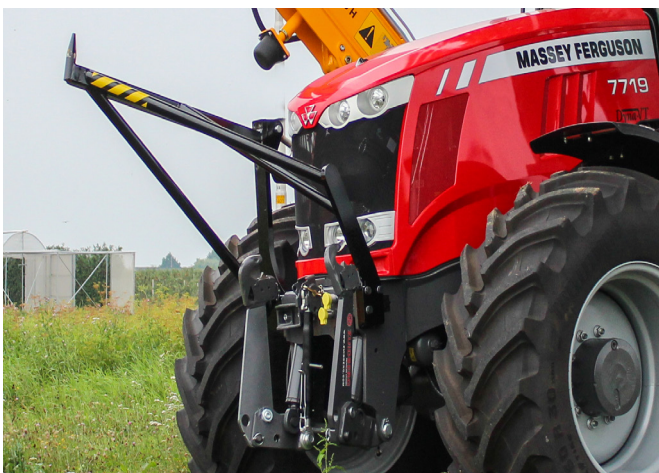
Work tool carrier on the front of the mounting frame. The boom rests on it in the transport position (MBK411).