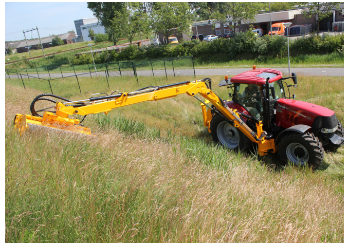
Cavalier with boom.