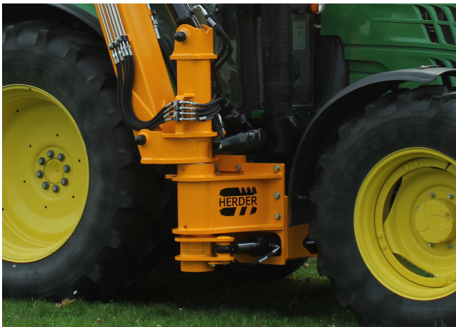
Slewing unit Cavalier MBK411/420A/420V

The Cavalier is available with different types of slewing system and four different swivel angles.