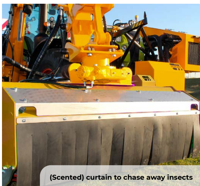
(Scented) curtain to chase away insects

A scented mower curtain as extra protection against flying insects. An additional air outlet at the front of the mower blows insects away from the mower. This can be fitted with an extra scent to 'warn' insects from a distance.