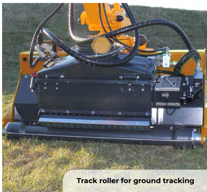
Track roller for ground tracking

The scraper on the roller ensures that it stays clean for perfect ground adaptation.